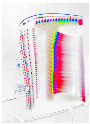
Thermographic testing of turbine blades

InfraTec supports this quality assurance by supplying high-performance and reliable infrared cameras from its own Imagel R^{\otimes} series manufactured in Dresden. The geometric resolution of 640 x 512 pixels being high for commercial, cooled thermal cameras provides together with a fast frame rate the necessary prerequisites to realize the test of every turbine reliably but also in economically justifiable time.